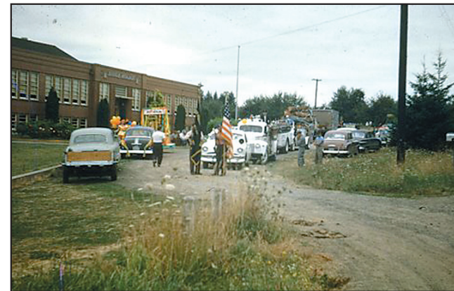
The brick school on Boones Ferry Road was the starting place for the Crawfish Festival parade for many years.