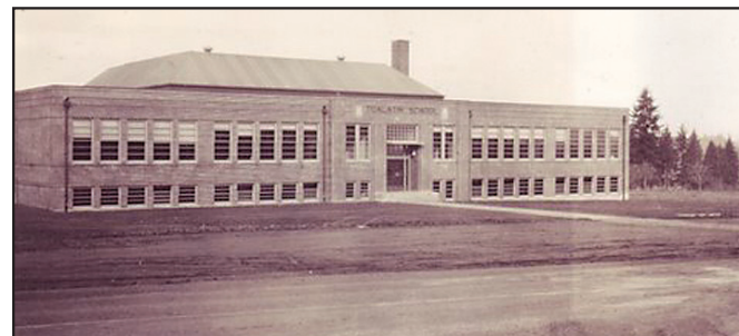
Tualatin Elementary School was state of the art in its time. The school board borrowed the plans from Collins View School, and the bricks were hauled in from Willamina. Teachers would open the windows on warm days with a long pole with a hook on the end.