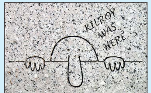
During World War II this was a symbol for the American serviceman. Any place in the world where one of them went he would see it. It was found in restrooms, on trucks, tanks, ships, bombed out walls, and almost any place it could be painted, panned, scratched, or chalked. Even during an invasion or battle, someone would leave this symbol where those following would see it. It was a symbol of courage, pride, encouragement, and very definitely a morale booster. That is why it was selected to represent all the service personnel who served in World War II all around the world. This is a loving memorial embracing all who served during the World War II years from 1940 through 1945.