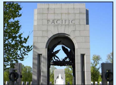
The Pacific Arch is on Southern end of WWII Memorial, depicting Pacific Theatre actions.