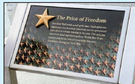
Plaque on Freedom Wall. Freedom Wall holds 4,048 gold stars. Each gold star represents one hundred American service personnel who died or remain missing in the war. The 405,399 American dead and missing from World War II are second only to the loss of more than 750,000 Americans during our Civil War.