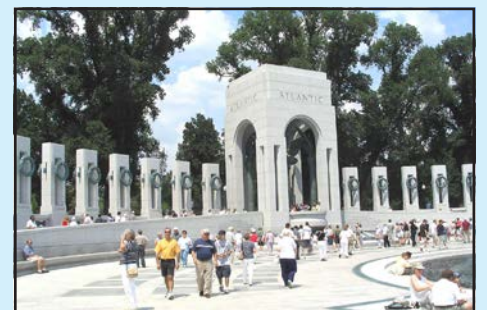
The Atlantic Arch is on Northern end of WWII Memorial, showing Atlantic Theatre action.