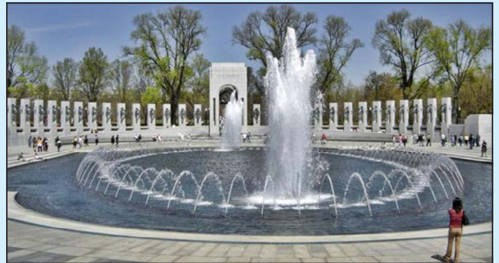
Rainbow water display in center of WWII Memorial.