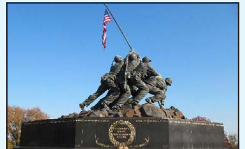
Joe Rosenthal's famous Feb 23, 1945 flag raising photo on Iwo Jima won a Pulitzer prize.