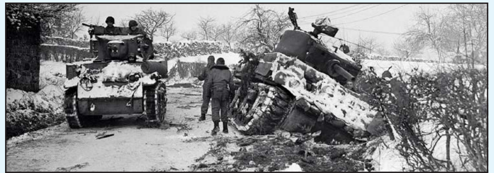
The Battle of the Bulge was Germany's last major offensive, conducted in winter conditions in Belgium. France and Luxembourg on the Western Front. It caught the Allies by surprise.