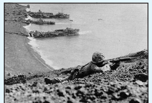
Battle of Iwo Jima was one of the bloodiest in Pacific theatre, costing 6,821 American lives.