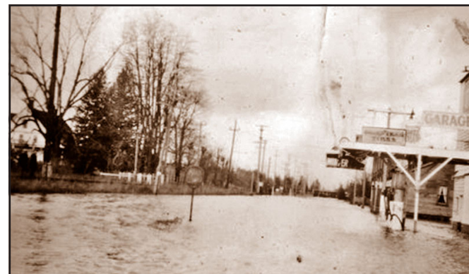
Boones Ferry Road was flooded in 1937. On the left is the Sweek House, on the right is Buswell's garage and on the corner stood the brick store.