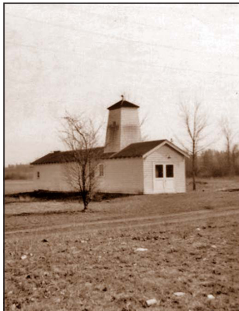
The City well was just off Nyberg Road.