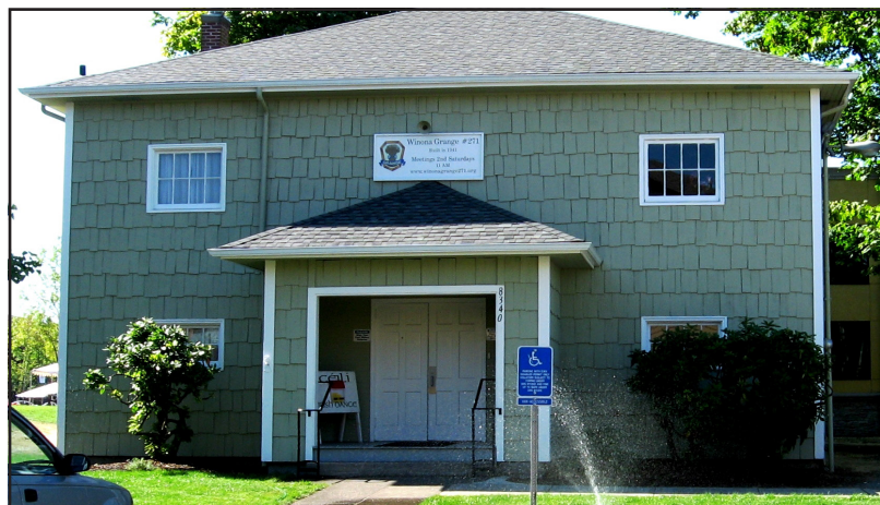
Winona Grange hall was built in 1940. Previously the organization held meetings in the upstairs of the old store in Old Town, then the High School gymnasium.