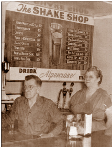
The Shake Shop was between the white store and Hawxhurst's meat market.