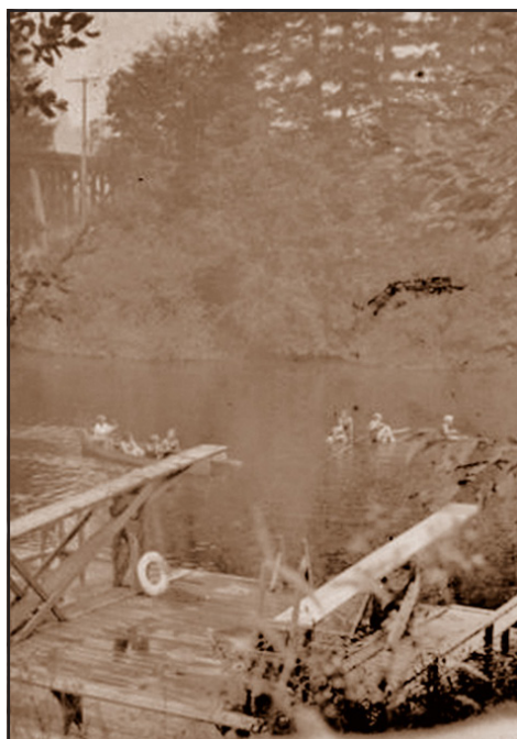
Tualatin's swim park in the 1930s. Located close to where the boat ramp is now, and close to the Southern Pacific railroad trestle.