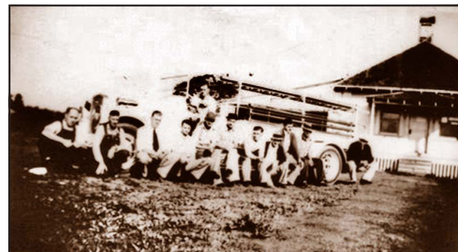
City Hall was also the home of the Tualatin Volunteer Fire Department