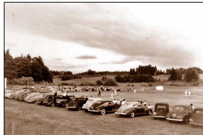
The town team played baseball in this field along Nyberg Road. The Hervin Company would later occupy the site which is now part of the Commons.