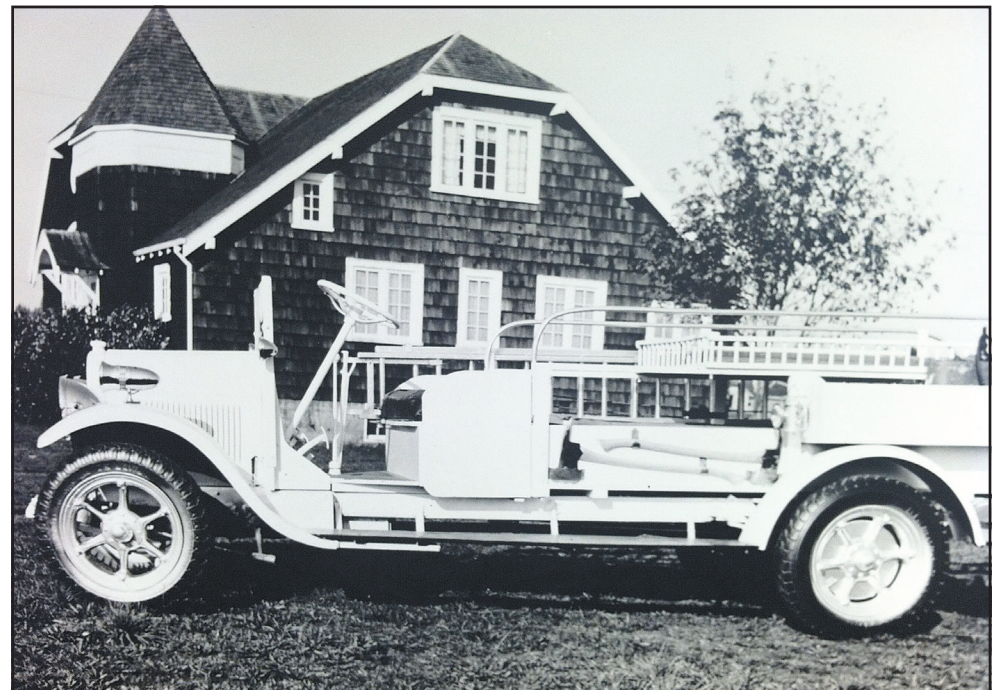
Close-up photo of first fire truck. Note: Tualatin Methodist Church, now Tualatin Heritage Center in background. First city hall and church were located on north east side of Boones Ferry Road and Tualatin-Sherwood Road intersection (north of McDonald's) Also note: Big oak tree in background, one of many toppled by 1962 Columbus Day Storm (discussed in Fire History Book)