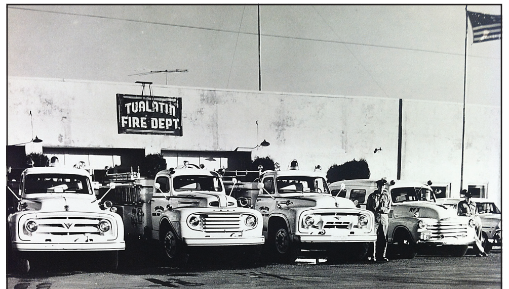
Historic photo of a Tualatin Fire Station, circa 1948.