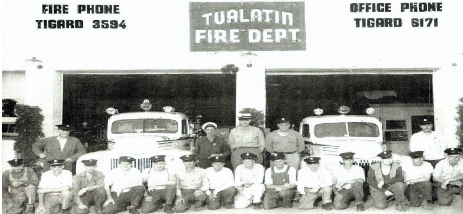
Group Photo of Tualatin Fire Department volunteers in front of the fire station they built and owned on 84th Ave. ca. early 1950s

WRITTEN BY: YVONNE ADDINGTON , PAST PRESIDENT OF TUALATIN HISTORICAL SOCIETY