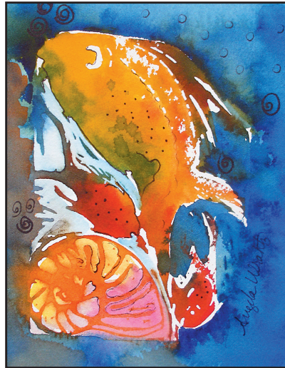
BLUE FISH by Angela Wrahtz

Aman, who teaches watercolor classes every month at the Tualatin Heritage Center. (Learn more about her classes by picking up a brochure at the Tualatin Heritage