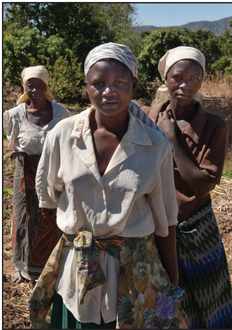
These three women live in a very isolated rural area, but have enjoyed exponentially improved agricultural output through assistance in developing a system for storing water and watering via drip irrigation.

with unique and motivational endeavors to light with the hope that such exposure will encourage them to continue their efforts, despite frequent lack of acknowledgement, to motivate others to help them, as well as motivate younger persons throughout Zimbabwe.