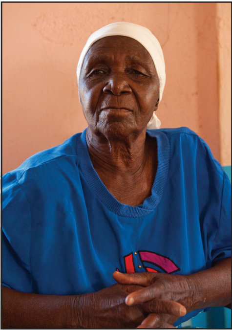
The mixture of hope and pride of this senior at a home for the poor is evident. She survives amidst meals and programs offered by the nuns who lead the home and retains her strength despite the challenges of living in Zimbabwe.