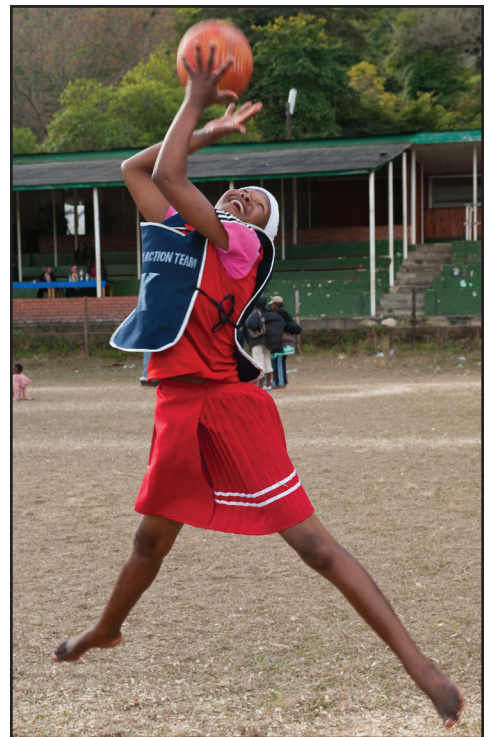
Sports programs are increasingly used to provide positive outlets for women - ones that were previously only available to men.