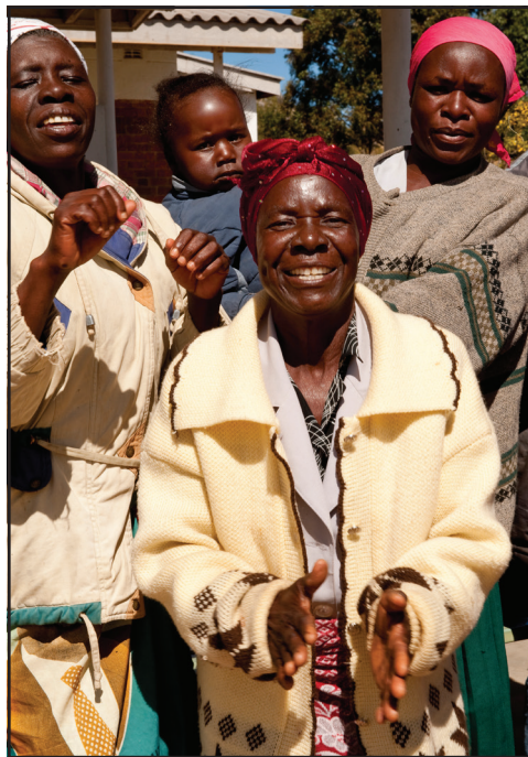
Women participate in a role play learning exercise on how to stand up to a husband who wants to take the family salary and spend it on non necessities. Women are coached by counselors on how to negotiate in safety.

Zimbabwe, as well as spending more time with previous women to learn more about their stories. The women are to be interviewed via a grant from the Oregon Regional Arts and Cultural Council (RACC), through assistance from Pro Photo Supply in Portland, OR, and www.pixelegacy.com , as well as potential funds to be raised from http://www.usaprojects.org/projects . These women are expected to be from all levels of education and/or be involved in art, music, agriculture, economics, human rights, legal services, microfinance development and management, health care, HIV prevention, politics, energy and other businesses, etc. Candidates for interviews include women who are, at some personal sacrifice, advancing the lives of others in a manner that merits recognition and promotes inspiration.