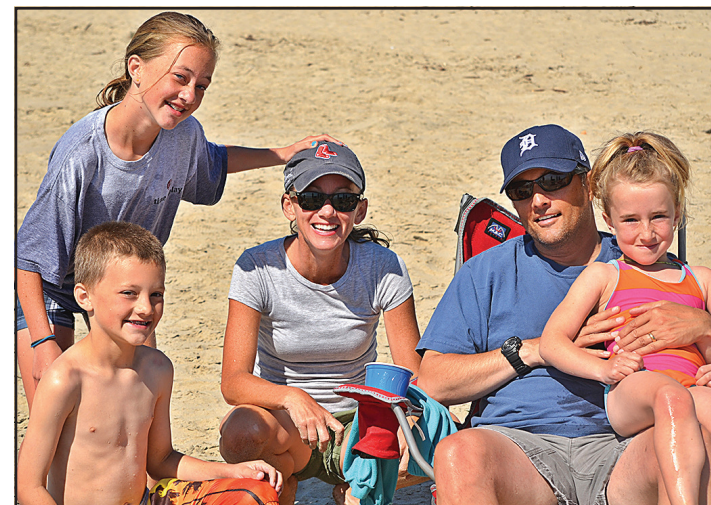
Vranizan family 2011