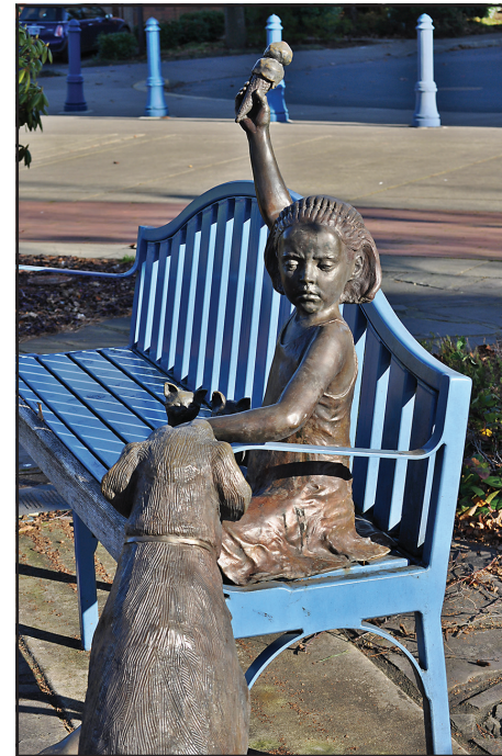
Sharing the Ice Cream

For example, in this picture of the Sharing Ice Cream sculpture found at The Commons Loop, notice the long shadows cast by the bench back rails, and of the trees beyond – for a photograph taken at 1pm, these long shadows are distinctive to winter.