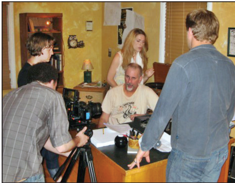
Ampersand Productions shooting last year's winning script, Alis Volat Propriis .

Even if you're not a writer and/or you don't plan to submit a script to the contest, please consider donating to Willamette Writers (and specify FiLMLaB). And remember that the Oregon Cultural Trust will match your