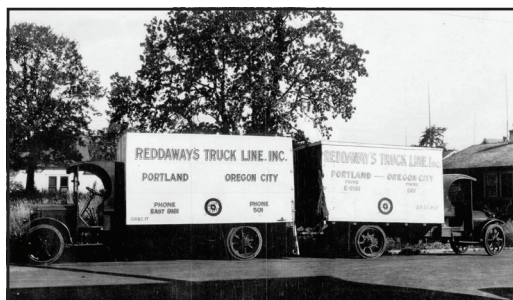
1924 G.M.C. 1923 Federal

3,500 trailers and 1,400 tractors that average a daily line haul route of 460 miles—compared to the original 9-mile route of the company's first truck that required two hours to travel.