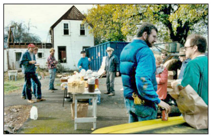
Dismantling the Hedges house and numbering every board