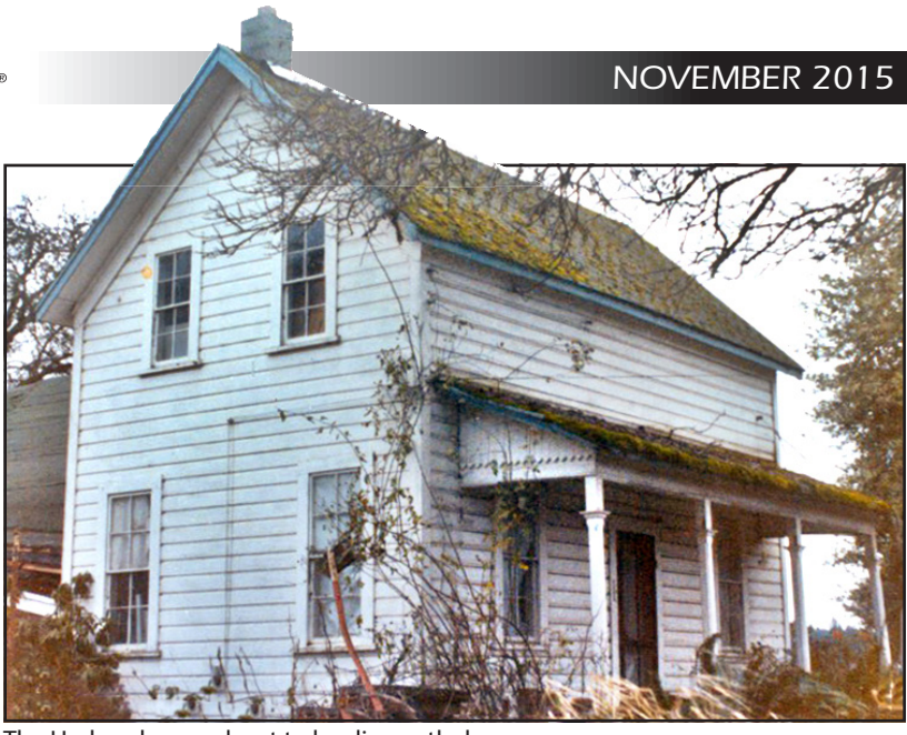
The Hedges house about to be dismantled