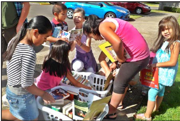
Volunteers from TTSD Books on Wheels helping children make their book selections.

If you would like to help TTSD Books on Wheels visit booksonwheels.weebly.com and sign up! All the info you need is on the site.