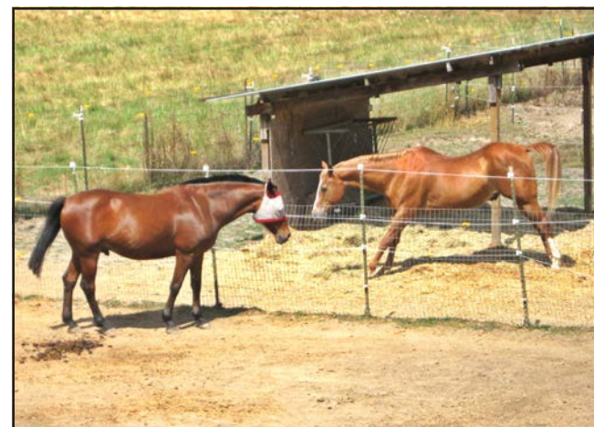
Two neighbors just hanging out.