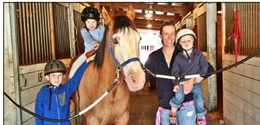
Lessons at Cindy's House of Horses is sometimes a family affair.

Cindy's House of Horses is located at 11105 Southwest Hazelbrook Rd., Tualatin. Borders can access their horses from 7 AM to 10 PM. People interested in boarding their horse, or taking classes with trainer Allison Girmai, can reach Cindy's by calling 708-567-6497.