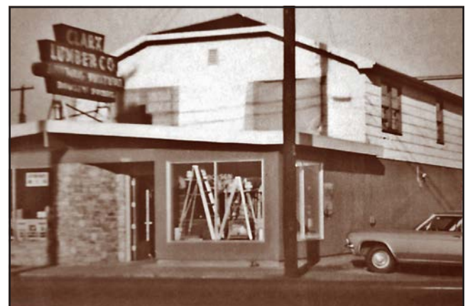
The building, soon after the Clark family took over the lumber store.