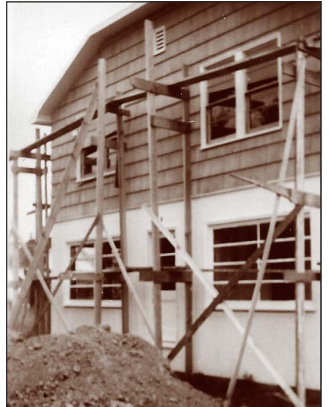
This building, still standing along Boones Ferry Road, was erected in 1946.