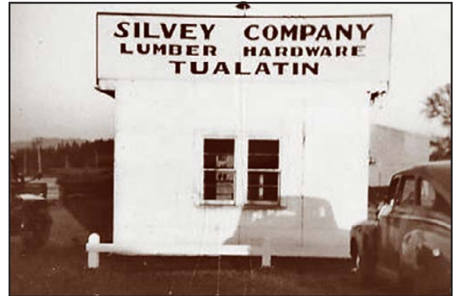
Silvey Lumber Company in 1944.