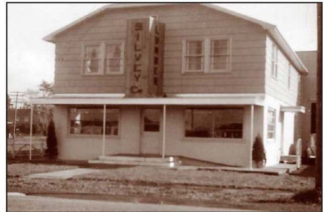
Silvey Lumber Company in 1961.