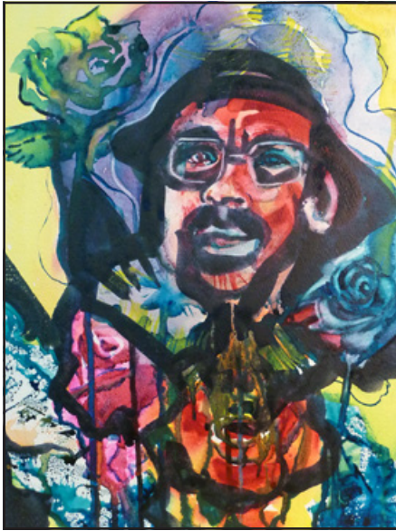
Pirate Undone by Roses