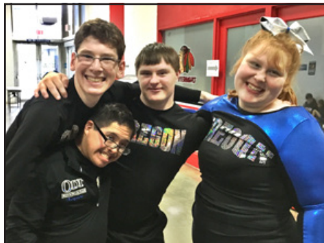
4 of the athletes waiting to go on stage.

Team Inspire also has a GoFundMe account at www.gofundme.com/oregon-dream-teams-inspire .