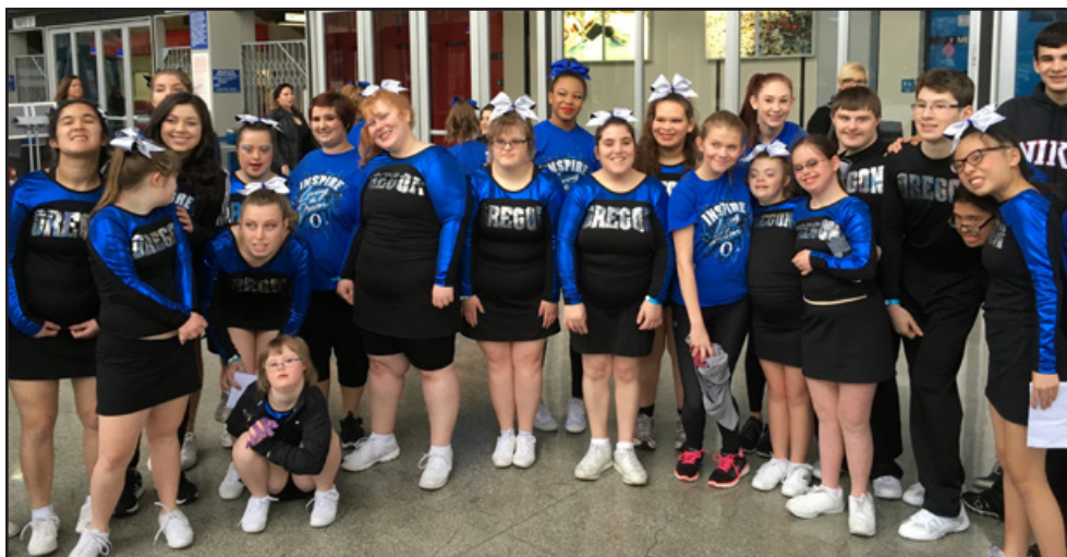
Waiting to perform at Memorial Coliseum.