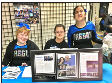
3 of the athletes fundraising at the Winter Cheerfest.